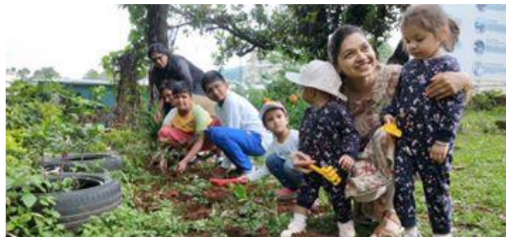
Tree Plantation by members of the society and students

World environment day was celebrated by the society in all its centres. The day was celebrated by planting trees and cleaning drives in the localities where the centres are located. An awareness campaign was organised in the head office premises