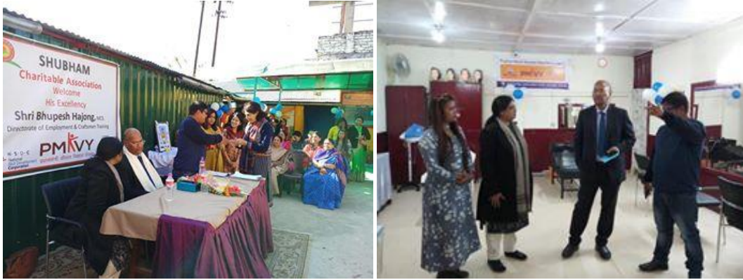
Inauguration of the Jhalupara Centre