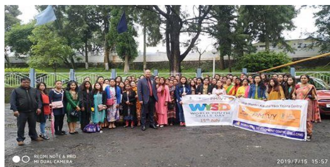
Director of DECT, Meghalaya with beneficiaries