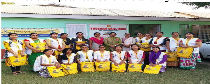
Distribution of Induction Kit for self employed tailoring batch, Udalguri