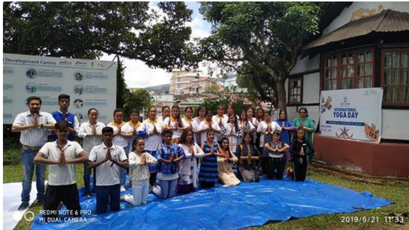
International Yoga Day at the Head Office

International Yoga Day was celebrated in all the centres run by the society. The main function was held in the head office. All the student beneficiaries, staff and the members of the society participated in the programme.