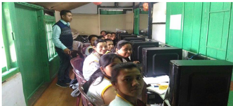
Basic computer course for the tailoring batch

A total number of 770 beneficiaries were trained in the fields of Computer Data Entry, Beauty treatment and Hair styling, Tailoring and Embroidery. Of these 770 student beneficiaries 300 were sent from the Directorate of Employment and Craftsmen Training, Government of Meghalaya. The balance 470 student beneficiaries were given the training directly by the society. Beneficiaries were mostly from the East Khasi Hills district of Meghalaya and Udalguri district of Assam. The trainings were done in the centres at Shillong and Udalguri. All the beneficiaries were handed over certificates after their appraisal was done. Some of the beneficiaries were given placement in various organisations and as in the previous year's most of the trainees in Tailoring opted for establishing their own business.