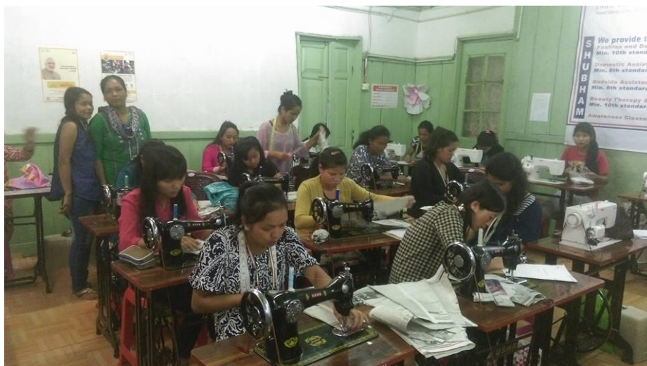
A tailoring class in progress

A total number of 630 beneficiaries were trained in the fields of Computer Data Entry, Beauty treatment and Hair styling, Tailoring and Embroidery. The beneficiaries were mostly from East Khasi Hills district of Meghalaya and Udalguri district of Assam. The trainings were done in the centres at Shillong and Udalguri. All the beneficiaries were handed over certificates after their appraisal was done. Some of the beneficiaries were given placement in various organisations and most of the trainees in Tailoring opted for establishing their own business.