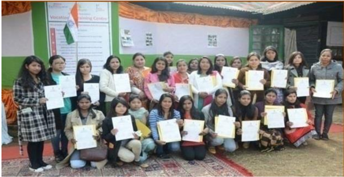
Beneficiaries awarded certificates