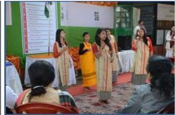
Independent Day celebration in the Head Office

Various other programmes like knowledge of first aid, awareness of state government and central government schemes were also held in all the centres for the benefit of the beneficiaries. Programmes relating to employment avenues and soft skills required for interviews were also done in all the centres.