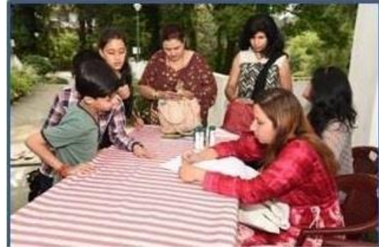
Skill fest 2016